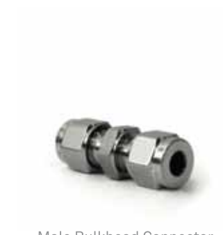
Male Bulkhead Connector