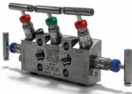
5VBD Series Needle Manifold