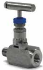
UN MxF Series Needle Valve