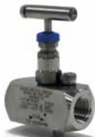
UN-V Series Needle Valve