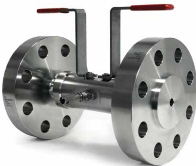
XC Finished Construction