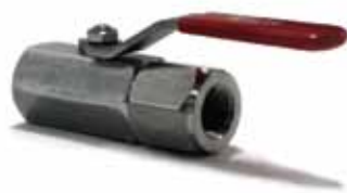
UE Series Ball Valve