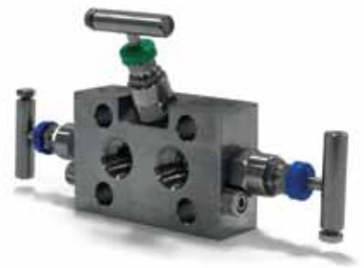
3VBD Series Needle Manifold