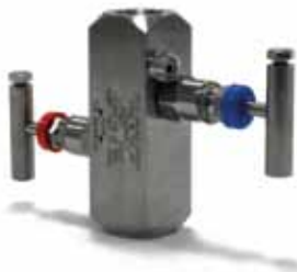
U2VG FxF Series Needle Manifold