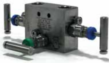
3VR Series Needle Manifold