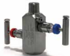
U2VG Series Needle Manifold