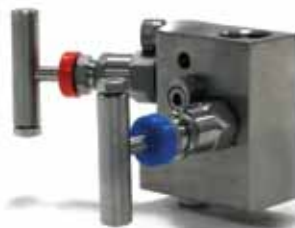
U2VR Series Needle Manifold