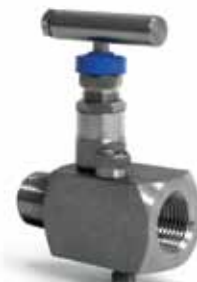
UN-V MxF Series Needle Valve