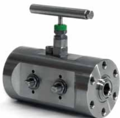
XC Stacked Cartridge