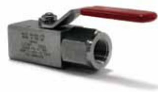
UB Series Ball Valve