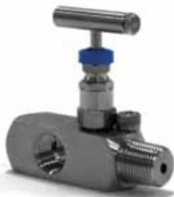
UGV Series Gauge Valve