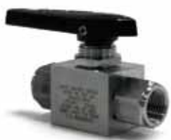
SN Series Ball Valve