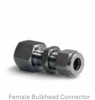
Female Bulkhead Connector