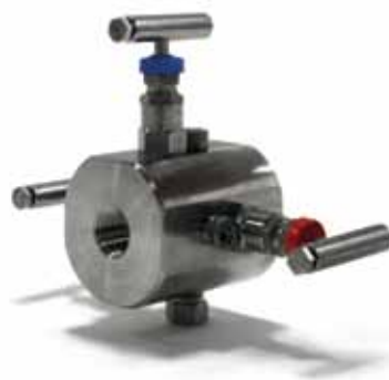
DBB 'N' Series Manifold