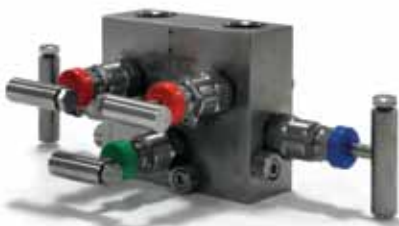
5VR Series Needle Manifold