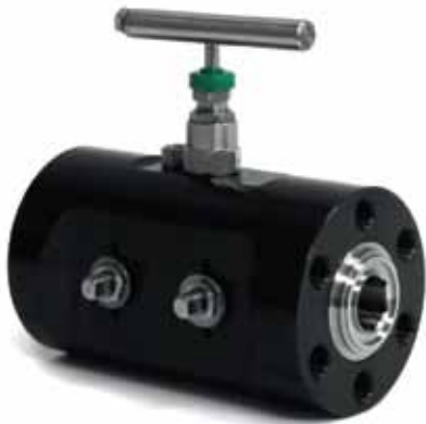
XC Stocked Cartridge