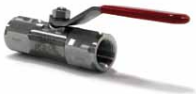
PB Series Ball Valve