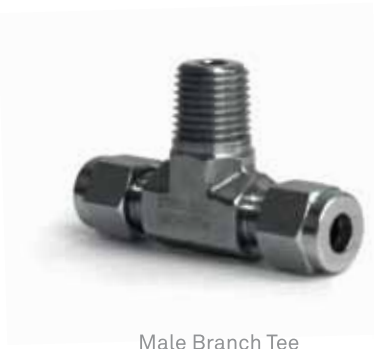
Male Branch Tee