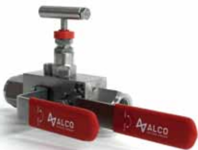
DBB 'B' Series Manifold