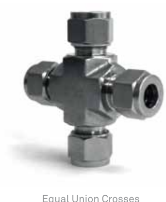
Equal Union Crosses