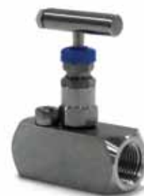
UN Series Needle Valve